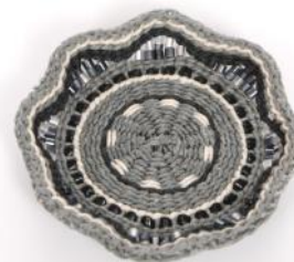
8 F 026 8 Hour

Dimensions: 11"L x 6"W x 7"H w/hdl Material & Preparation Fee: $50.00 Intermediate Weaving Level