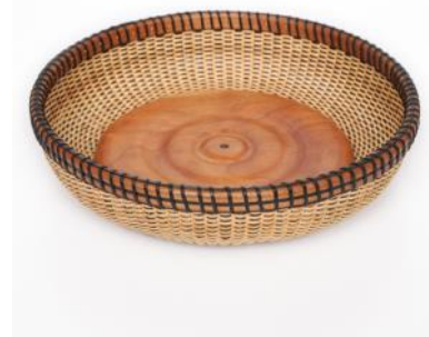
8 Th 012 8 Hour

Dimensions: 5"L x 1"W x 5-6"H w/o hdl Material & Preparation Fee: $61.00 Intermediate Weaving Level