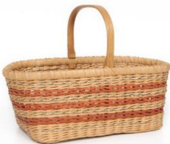
8 F 025 8 Hour

Dimensions: 13"L x 7"W x 14"H w/hdl Material & Preparation Fee: $75.00 Intermediate Weaving Level