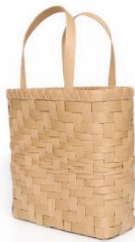
8 S 037

Dimensions: 13"L x 8"W x 11-1/2"H w/o hdl Material & Preparation Fee: $75.00 Intermediate Weaving Level