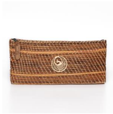
12 FS 021 12 Hour