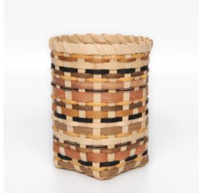
4 Th-PM 020 4 Hour

Dimensions: 6"L x 10"W x 5"H w/o hdl Material & Preparation Fee: $38.00 All Weaving Levels