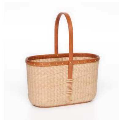
8 F 029 8 Hour

Dimensions: 33"C x 10-1/2"D x 7-1/2"H Material & Preparation Fee: $72.00 Intermediate Weaving Level