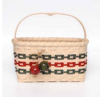
4 Th-AM 019 4 Hour