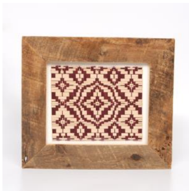
8 F 027 8 Hour

Dimensions: 9-3/4"C x 3"D x 5/8"H Material & Preparation Fee: $30.00 Intermediate Weaving Level