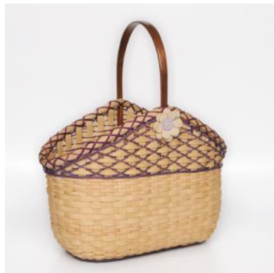
8 Th 010 8 Hour