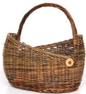
8 F 024 8 Hour