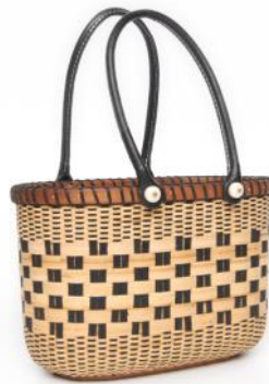
12 FS 022 12 Hour

Dimensions: 11-1/2"L x 1"W x 5-6"H Material & Preparation Fee: $91.00 Intermediate Weaving Level