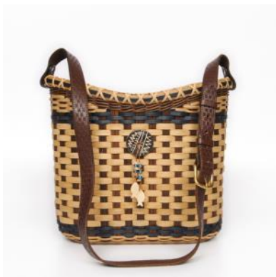
8 S 036 8 Hour