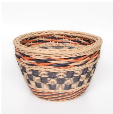
8 F 028 8 Hour

Dimensions: 8-1/2"L x 6-1/2"W Framed: 14"L x 12"W Material & Preparation Fee: $70.00 Advanced Weaving Level