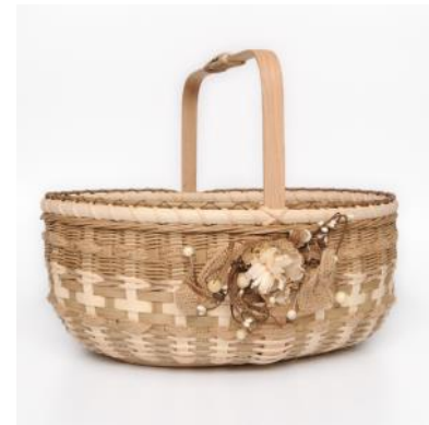
8 S 038

Dimensions: 10"L x 4"W x 11"H w/o hdl Material & Preparation Fee: $50.00 Intermediate Weaving Level