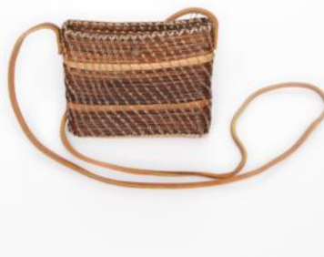
8 Th 011 8 Hour

Dimensions: 12"L x 8"W x 16"H w/hdl Material & Preparation Fee: $63.00 Intermediate Weaving Level