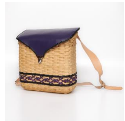
8 F 023 8 Hour