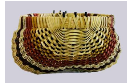
8W003 Nantucket Desk Organizer Candy Barnes

This traditional basket will start on an oval hoop. Students will learn how to notch initial ribs, weave a 5-point lashing, sight, whittle, and insert primary and secondary ribs, wrap hand grips and weave to a successful conclusion. Students may want to include seagrass in the weaving. Students should bring to class sharpened knife and long awl and shears. Basket may not be entirely completed in class but students will know how to finish.