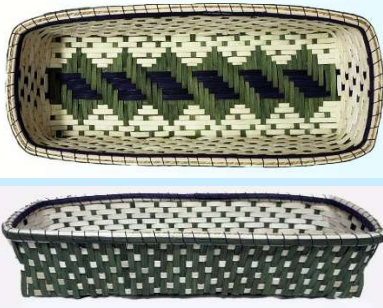
8W001 Table Runner Gina Kieft

15" L X 6" W X 3" H Teaching and Material Fee: $80 Weaving Level: Advanced